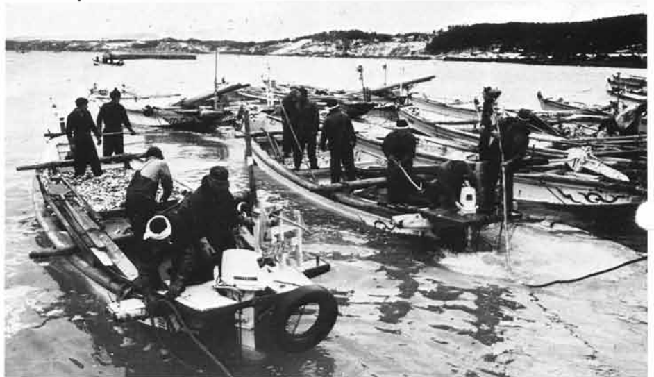
What a bumper! A fishing base is buzzing with excitement.

Akita Prefecture, Northeast Japan is very famous for its shallow-sea fishery of hatahata (a sort of codfish). This fish has a habit to gather in schools around the coast of Akita late in autumn each year. Recently Yamaha outboard motors have appeared in the scenes of hatahata catching. Japanese boats equipped with light and compact Yamahas are assuring fishermen of a larger catch of hatahata than ever.