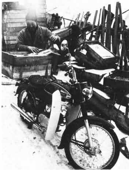
A light Yamaha motorcycle is offering a helping hand in carrying fish.