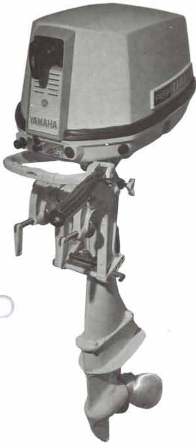
Unique kerosene model P-125A.