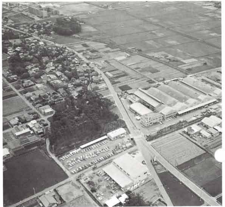
A whole view of Sanshin Kogyo, Yamaha's specialized outboard plant