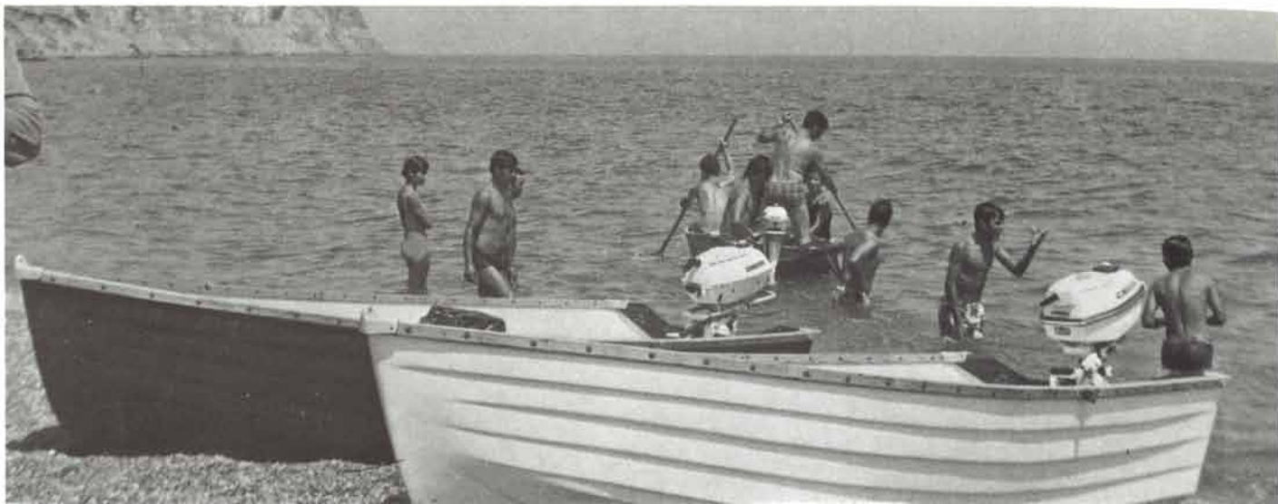
Taken at the southeast coast of Spain. Smaller Yamahas tremendously add to their pleasure on the water.