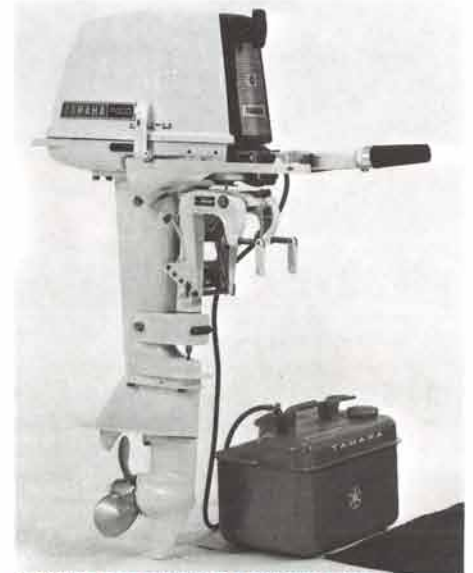
P-200 is also available in kerosene type.

It features tremendous advantages of lower fuel cost, and easier purchase of fuel in most parts of the world. We advise all of you to make them your strong selling points, and to develop new markets in this field to attain the largest possible results of sales drive.