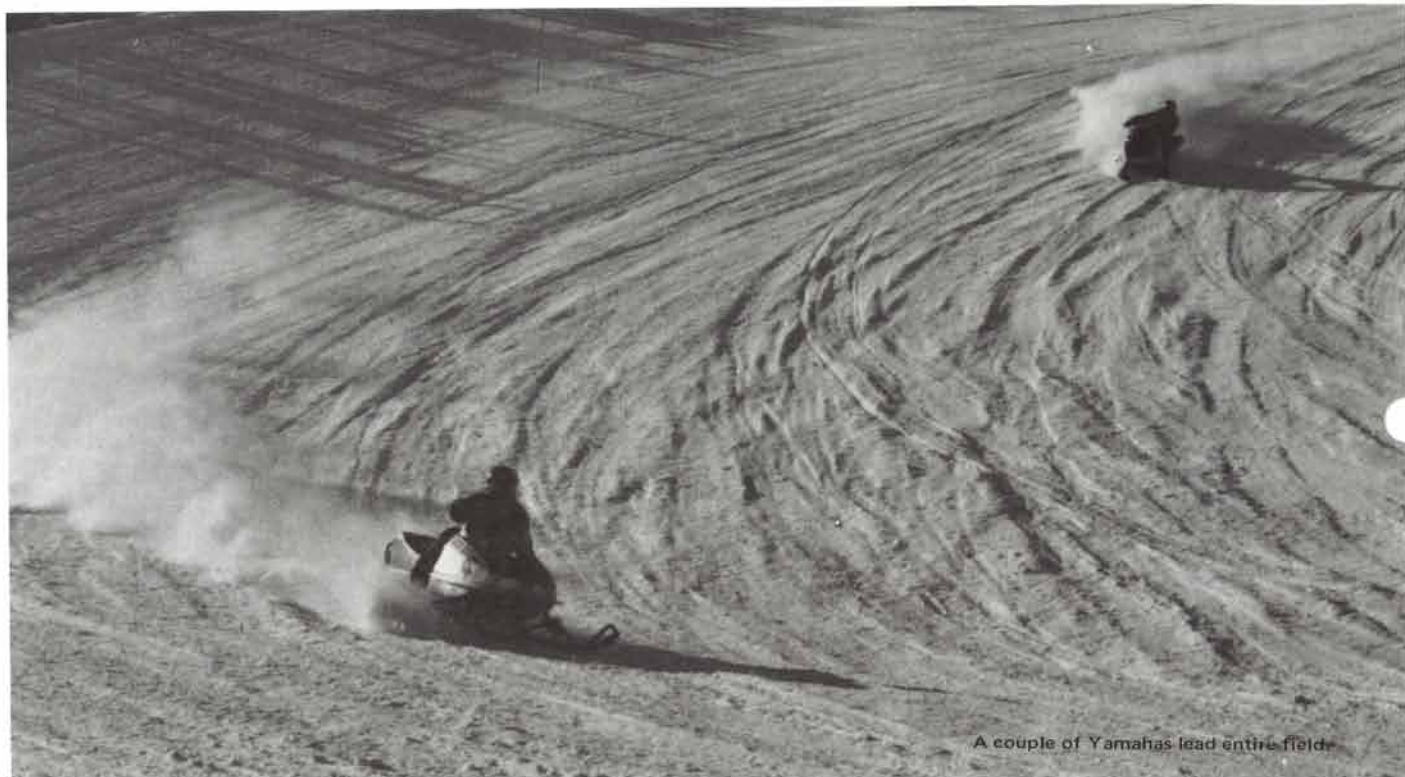
A couple of Yamahas lead entire field.