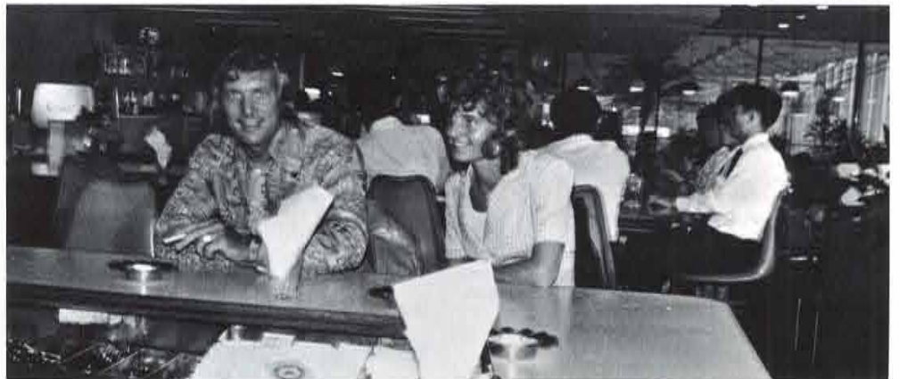
Photo: at the rest room of the Haneda Air port.