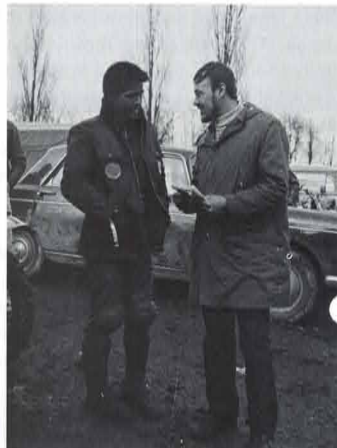
Torao's Brilliant Success

Torao was nominated a contender for the A group, riding the powerful works machine equipped with the newly developed Yamaha Mono Cross rear suspension.