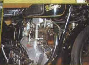
The British vintage bike "Velocette".