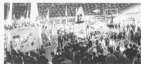
At the show Yamaha's various schools, marine events, resort enterprises and marine club activities were represented on display panels.

Marine Club activities: Last year, the Yamaha Marine Club was established as one of Yamaha's efforts dedicated to creating an environment in which people