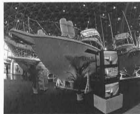
Yamaha PC-30III (right) and Yamaha-38 Marlin-SF

The Yamaha PC-30III (new model) can serve equally well as a family cruiser or trolling boat. The new 1990 models in this series include the Yamaha SR-20C, a boat designed to let family and friends maximize their enjoyment of marine leisure activities, such as day-cruising, water skiing, diving, and on-board partying.