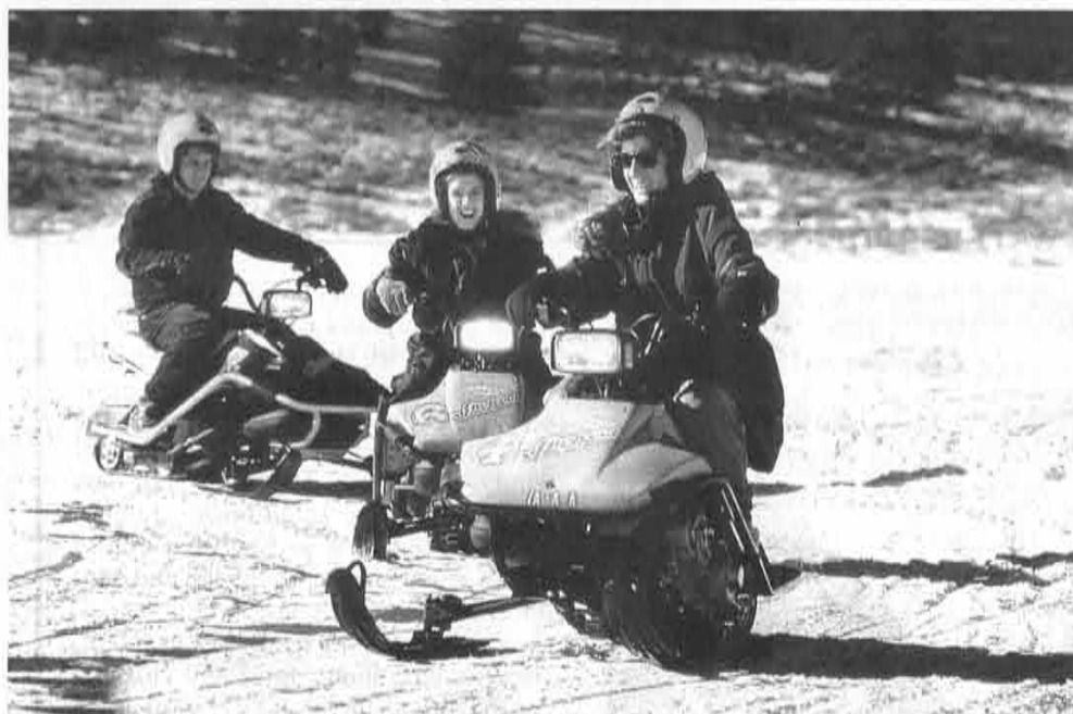
Having fun on "Snoscoots".

summer activity is the annual "Appreciation Dinner and Dance" for all the farmers, neighbors and city officials who let them use their land in winter. Every year after mending the fences, collecting the trail signs and cleaning up the area it's time to say thank you. This tradition has become an local institution. Then on Labor Day in September, the club has their Boat Party.