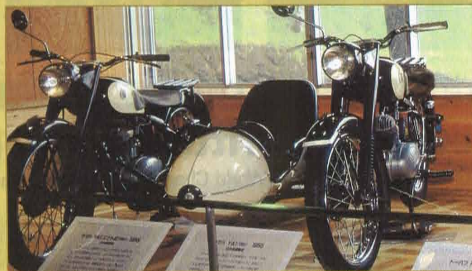
Two Yamaha YA-1s; one with a sidecar. The first event joined in by the leading Japanese motorcycle makers aimed at bolstering the motorcycle industry in Japan was the First Asama Volcano Race. YMC entered this race with its newly introduced first model, the "YA-1", and swept the first four places.

Meanwhile in the racing arena, the race that might be considered the origin of international motorcycle