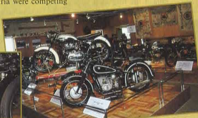
A model by one of the old Japanese makers that no longer exist, DSK. Behind it a famous British Triumph is on display.