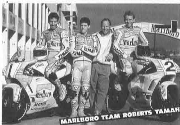
From left: Lawson, Kocinski, Roberts and Rainey

we will report on the highlights of the first round of the '90 season at Suzuka, Japan.