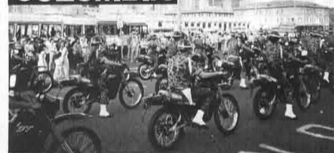
The reception ceremony