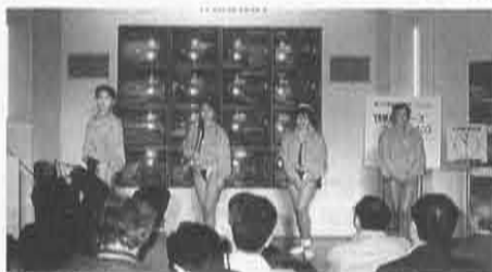
The 1990 Yamaha Marine Ladies. They will help to promote many marine events this season.

Yamaha sponsors and supports many boat races involving a variety of craft ranging from dinghies to cruisers both nationally and internationally. For example, Yamaha Motor is an official sponsor of the Nippon Challenge America's Cup 1991 Committee for Japan's first participation in the '92 event, as well as the official builder of the challenging boat. Also, we are planning to participate as title sponsor in the "Yamaha Osaka Cup - Melbourne/Osaka Double-Handed Yacht Race 1991!" This longitudinal cross-Pacific yacht race will be held in March of next