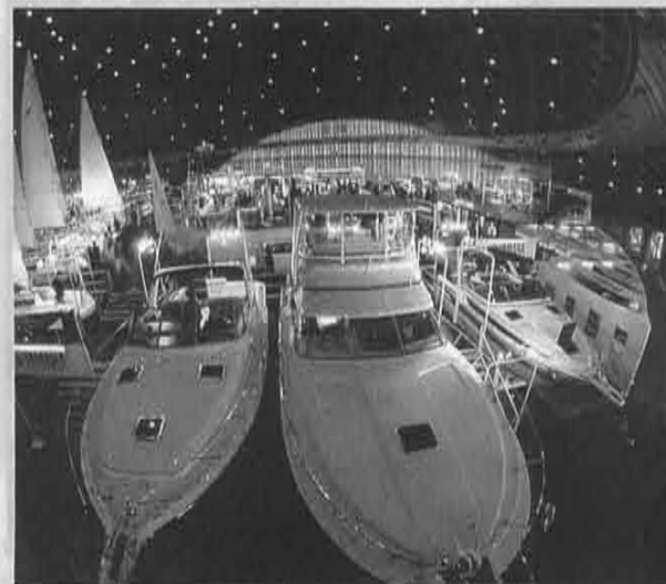
From right: Formula-29PC, Trojan 12m Convertible and Tiara 3600 Open.

This complete line will surely meet the increasingly diversified and individualized needs of Japanese users. Besides marketing these products, we will provide customers with advice on how best to enrich their marine leisure experiences.