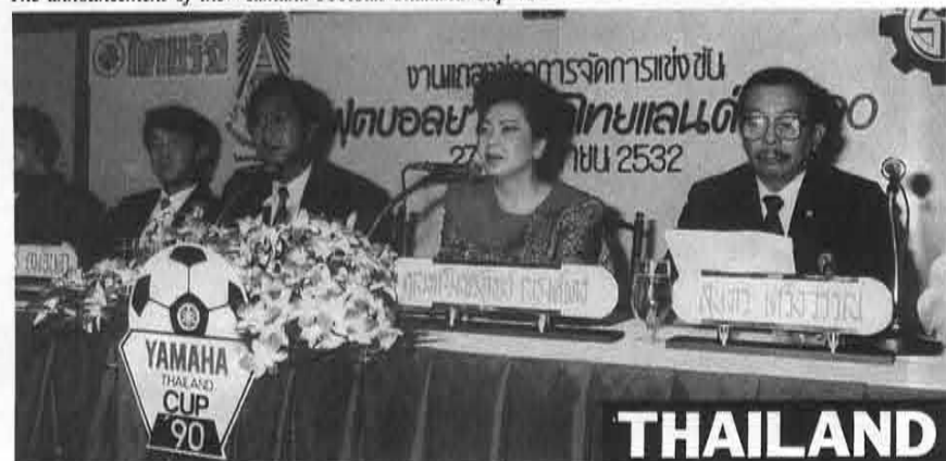
The announcement of the "Yamaha Football Thailand Cup VI"