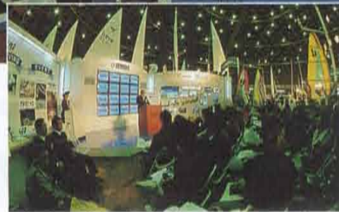
Many journalists gather for the press conference at the Yamaha booth on opening day.

Yamaha has also invested a lot of effort in educational and promotional activities. We have opened a variety of schools, and have maintained a high profile in attracting marine enthusiasts through our support and sponsoring of competitions and other marine-related