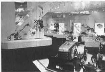
Cologne Garden Fair