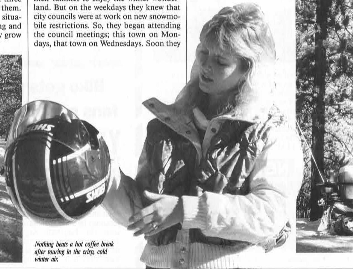
Nothing beats a hot coffee break after touring in the crisp, cold winter air.