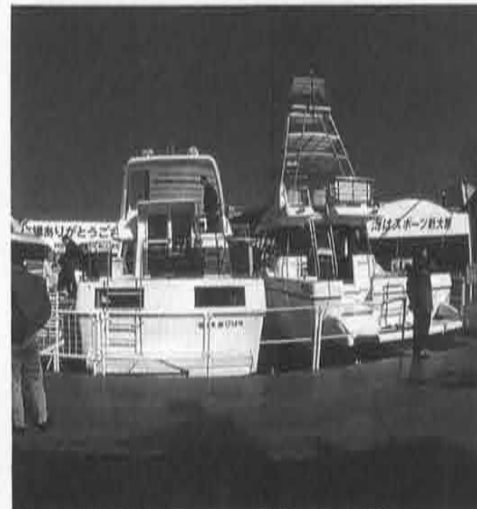
Yamaha-51 Marlin-SF (right) and Yamaha SC-38

The Yamaha 51 Marlin-SF and Yamaha 38 Marlin-SF are also offered in this series for serious ocean fishing enthusiasts. These boats meet the needs of private individuals, corporations, and organizations seeking the benefits of larger boats.