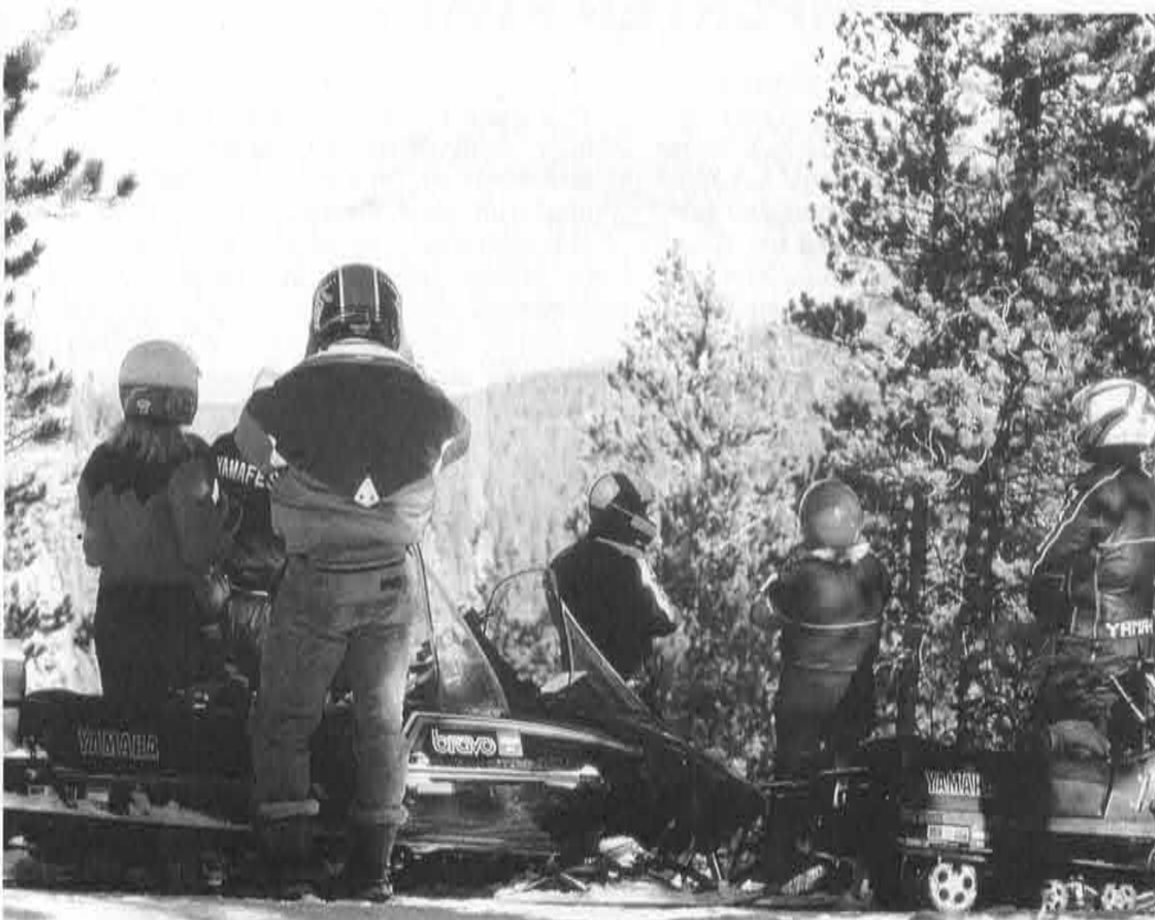
Stopping for a rest at a scenic spot.

Now, after 19 years, the Minnetonka Snow-