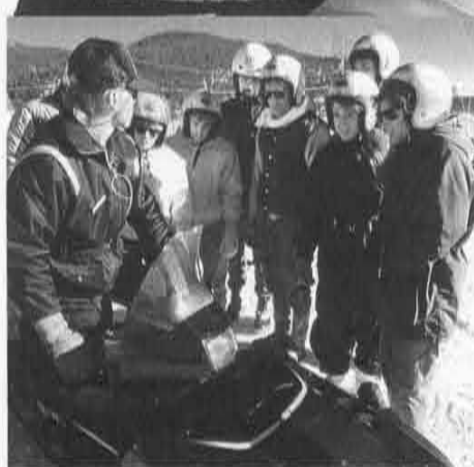
Teaching young people about proper riding through a tie-up with a Yamafest.

mobile Association is as strong and active as ever. A core of twenty families from the old days remain, while new members join yearly to keep the membership at about 50 families. They are a close group of friends who share similar hobbies and interests. They remain politically active, too, being well known to State and Federal officials as the "guys with the white hats", the club trademark. One of the reasons the Minnetonka Snowmobilers stay together is because they have fun together. Their meetings in summer are brief on business and long on fun and games, such as watching snowmobile videos, boating, motorcycling, etc. But, the club's most important