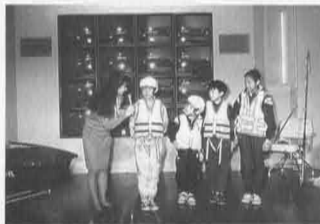
At the Yamaha booth, children attending our Junior Yacht School were interviewed after which they demonstrated how to put together a dinghy.

Yamaha's promotional activities include boat license schools, yachting schools (dinghy courses, yachting room for instruction of basic yachting knowledge and junior yachting schools for juniors from 9 to 15 years old) as well as boardsailing schools, Marine Jet (Water Vehicle) schools and other kinds of licence schools. These schools are designed to help expand the base to greater numbers of people who enjoy marine sports while also introducing them to the variety of marine sports.