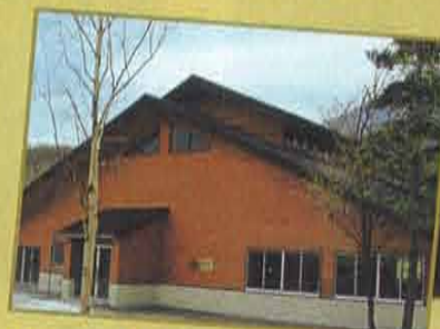
The Asama Memorial Cottage

racing, the Isle of Man Tourist Trophy, had been running since 1907, and the Road Race World Championships had begun in 1949, bringing great new impetus to the sport and to motorcycling as an industry and a culture. Old riders who know the Asama days well and new generation riders alike, everyone who visits the Asama Memorial Cottage is moved by the displays of bikes from the "good old days" of motorcycling. In the visitors' register in the Cottage we read words like "I was really excited to see real models of the bikes that I had only known by name until now," and "I can feel a sort of human warmth in the shapes and styling of each of these models," expressing a love of motorcycles that transcends the boundaries of time and generation. Most of the bikes here return to their owners after a lease of usually one year to be replaced other classic bikes.