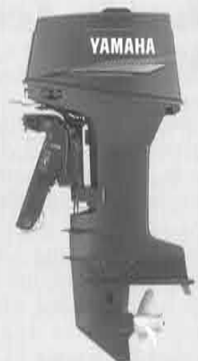
A total of 50 sets of Yamaha outboard motors and YAM inflatable boats were delivered to Mozambique by air.