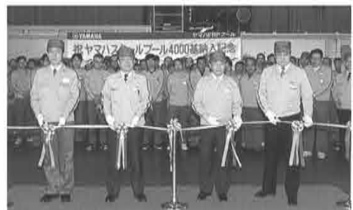
The memorable record was celebrated at a ceremony with the factory staff.

In 2001, Yamaha's unique FRP pool technology will be put to use for the first time in a world championship competition when we supply the specialized 50-meter main pool for the "9th World Swimming Championships Fukuoka 2001." What better proof of the reputation for excellence and reliability that Yamaha FRP pool technology has earned over the years.