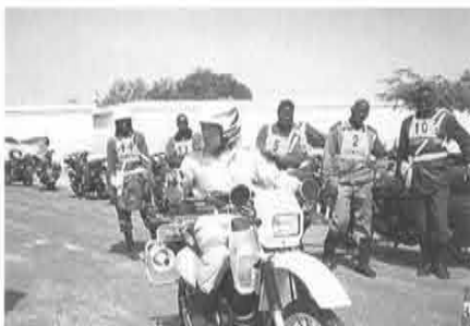
YRS is a great program for both customer satisfaction and after-sale service.

Over the past three years, OMDO has organized Yamaha Riding Schools (YRS) in 17 African countries for participants totaling more than 1,000 people. As one of the most fundamental means of promoting Customer and Community Satisfaction (CCS), these schools have included advanced riding courses for police and safe-riding instruction for people like NGO staff, national agricultural instructors and health-welfare workers performing vital roles across the African continent. In Africa, where the number of private motorcycle users is limited, supplying vital means of transportation for people who work for organizations like the UN or government agencies in fields like agriculture and public health is one of OMDO's important jobs. And, to help guarantee the satisfaction of these large-account customers OMDO has devoted itself to an ongoing program of YRS activities, like the schools that were held just this February in Senegal, Mali, Benin and Tunisia for users including police and customs officials. Besides riding technique, the participants also learned about points for regular inspec-