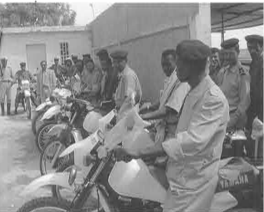
Mauritanian policemen with the newly delivered DT125P police bikes.

bike models developed by Yamaha's Overseas Market Development Operations (OMDO) from the offroad models DT127/175 and XT350 as part of its ongoing efforts to develop products to fit the needs of specific localities.