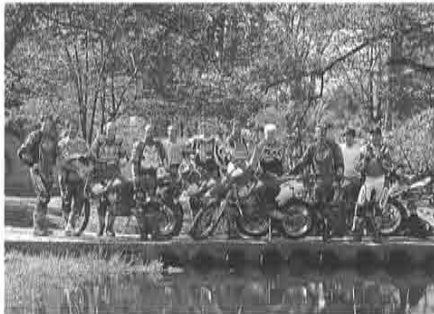
US journalists kicked off the year 2000 with an unforgettable tour of Costa Rica on the greatly improved 2000 WR400F.