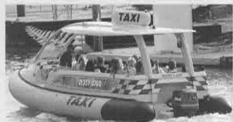
Yamaha powered Water Taxi at the America's Cup venue