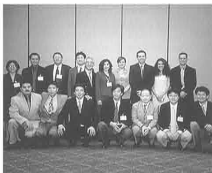
South American attendees of the conference held in Brazil to discuss streamlining management systems within the Yamaha Group.