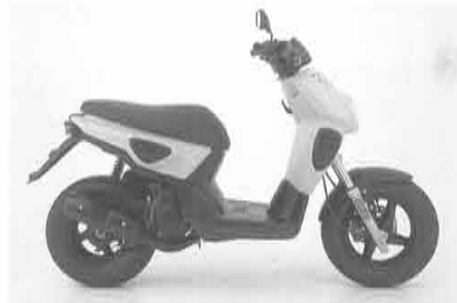
The MBK scooter Stunt is proving to be a real star in France.

This follows the excellent results from Scoot'n Scoot, which has been running