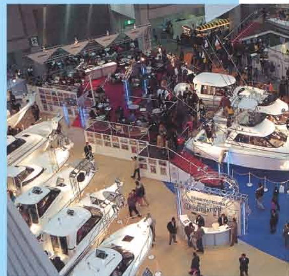
YMC had the largest number of boats on display of any maker in the show.

Among the highlight exhibits were new models like the fully outfitted family cruisers "24 Siesta" and "CR-28FB" with their focus on family leisure. Visitor attention also focused on the new environment-friendly Z series 2-stroke outboards with HPDI that achieve 4-stroke level emissions and fuel economy. And, Yamaha's