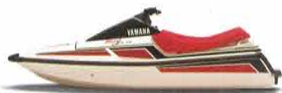
WaveRunner (MJ500T) was Yamaha's first Personal Water Craft, released in 1986 as a tandem model.