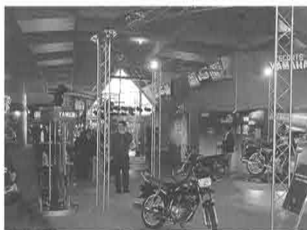
EYML's hopes are high for the new 4-stroke models as well as 2-stroke models.

As motorcycle use continues to grow in India, total annual demand is pushing the 5-million mark. This dynamic growth was reflected in the turnout of some 2.5 million visitors for Auto Expo 2000, the 5th edition of the annual automotive industry show in New Delhi. Escorts Yamaha Motor Ltd. (EYML), the manufacturer and distributor of Yamaha motorcycles in India, was among the nine motorcycle and 11 automobile manufacturers that mounted booths in the show.