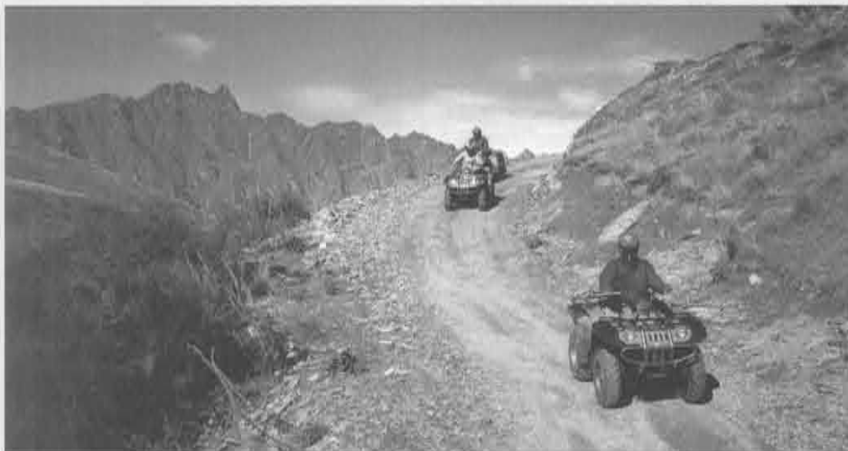
Typical south Island high country riding conditions