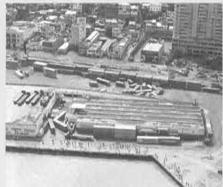
Container yard of the stricken port of La Gaira, Venezuela