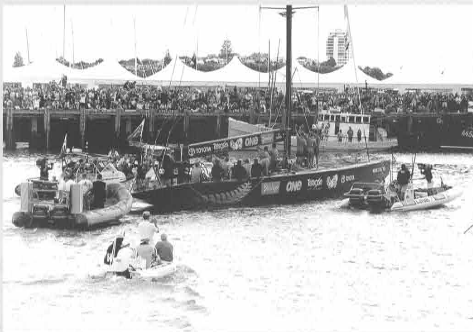
A victorious Team New Zealand and Yamaha powered support craft

At Moller Yamaha Limited we have been very active in the competition scene, supporting a number of New Zealand's top motocross, road racing and enduro riders under our Team Yamalube banner. In 1999, Team Yamalube riders won the 125cc,