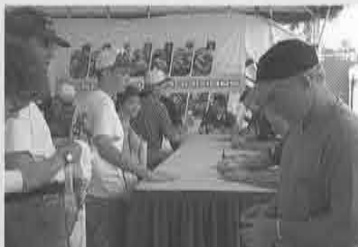
The Weekend of Champions brought out numerous legends to sign autographs for fans.

We are always looking for interesting stories.