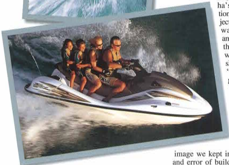
The SUV1200, the 1999 Watercraft of the Year, opening up demand in an entirely new “adventure touring” category.

“In the structural aspects like hull strength and basic concepts, conventional boat design technology could be applied. But, performance was a completely different matter. In boat design we have all the reference materials we need for making calculations about things like hull stability. But with the PWC