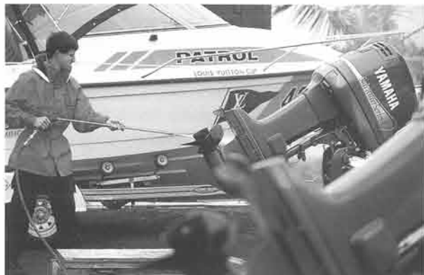
The range of Yamaha outboards being used include the 150SW, 200SWS, F115 and 150HPDI

In recent years, the city of Auckland has been likened to the Silicon Valley of yacht design and technology, with some