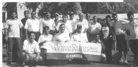
Representatives from Yamaha distributors in nine countries participated in the Middle East WaveRunner Workshop 2003