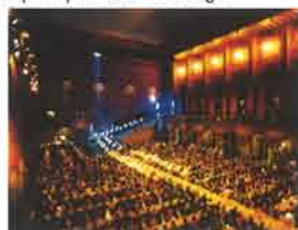
World attention focuses every year on the Nobel awards