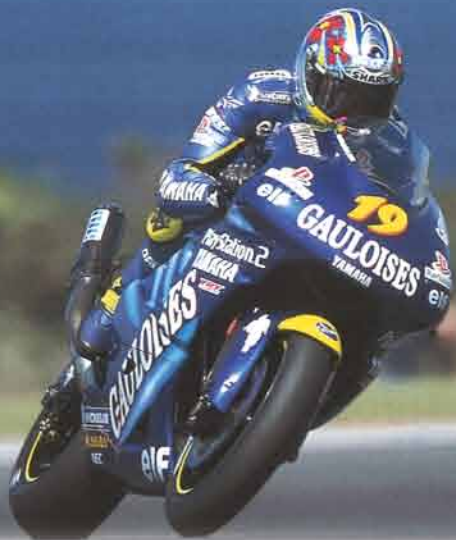
There will be five Yamaha YZR-M1 machines competing in road racing's premier MotoGP class in 2003