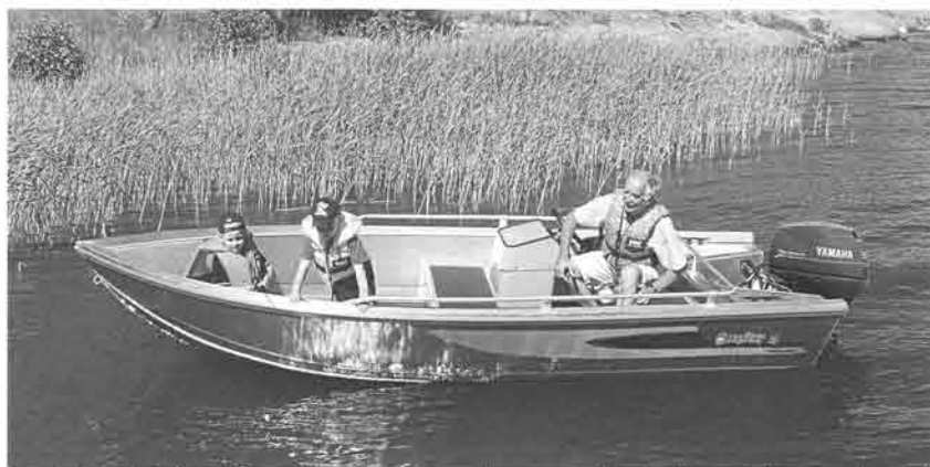
Scandinavia is a land of many lakes and long coastlines. It is said that one in every three Scandinavian families owns a boat, which makes this Europe's biggest outboard motor market

As of the 1st of January 2003, Yamaha marketing operations for Norway, Denmark and Sweden have been merged together to form a new company, Yamaha Motor Scandinavia (YMS). With business territory that also includes some of the surrounding countries, YMS's market will be Europe's largest in the marine and snowmobile sectors, and with consolidated efforts to strengthen marketing, its sales network, distribution and administrative functions, the company is aiming to become one of the most competitive marketing machines in the global Yamaha Motor group. Here we look at some of the specific steps the new company will be taking to ensure they are No.1 in the Scandinavian market.