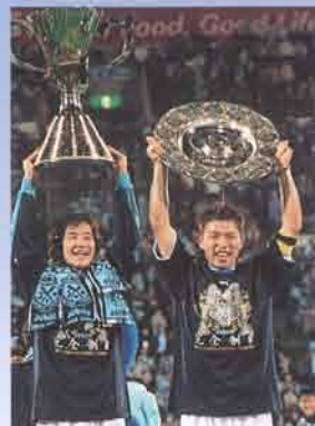
The team's top position in both goals scored (72) and goals allowed (30) proved the team's outstanding offensive/defensive balance

ning its third championship title in Japan's J.League. It was the first time in the league's 10-year history that a team won both the first and second stages of the season to clinch the title and eliminate the need for the championship playoff. The year 2002 may