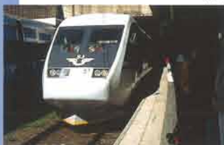
The "X2000" super express train runs between Stockholm and Copenhagen