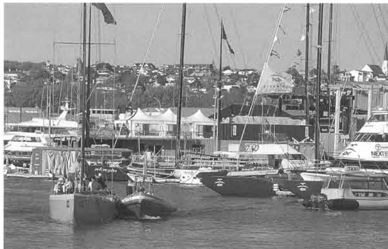
About 200 Yamaha outboards are being used on official and syndicate support boats in the America's Cup 2003 and Louis Vuitton Cup competitions