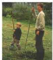
Swedish children are taught from a young age to love and respect the natural environment