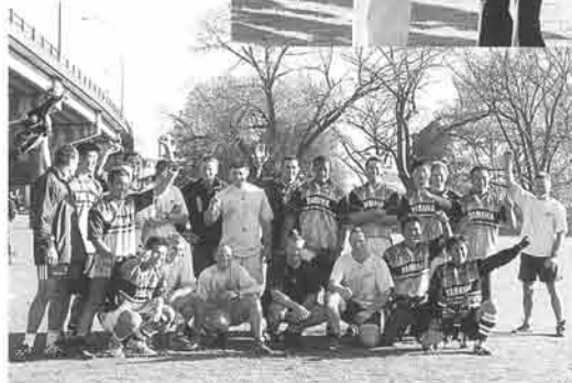
Yamaha RFC and Team New Zealand players