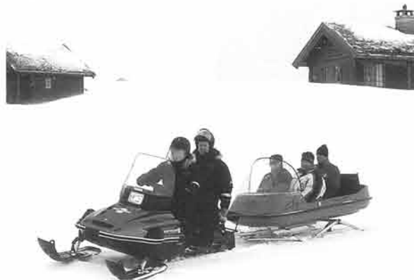
A snowmobile with a sledge is perfect when a group of people is going to their cottage

The dealers, as well as YMS, can also make use of the customer directory that is gradually built up with card-customers to send direct-mail offers to different customer groups. PowerCard is also available with an integrated euroservice-function that entitles the holder to cost-free guaranteed service in all of Europe on all Yamaha's products.