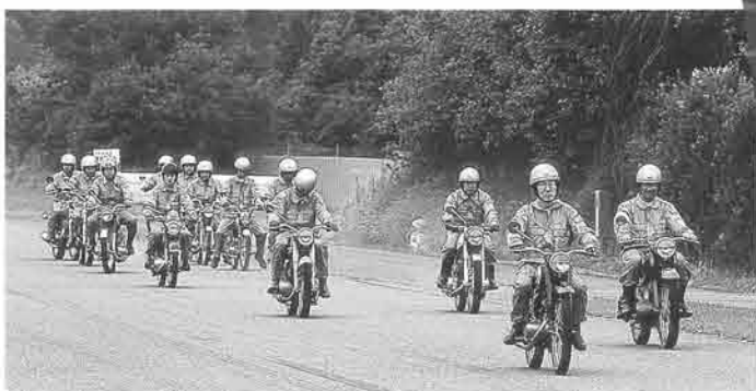
In the production model parade, 14 nostalgic Yamaha motorcycles appeared