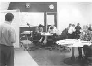
Yamaha business school. For our dealers the education in Yamaha business school has meant a new way of doing business. The result has become more satisfied customers and increased sales

We are constantly working to strengthen the Yamaha brand and create more satisfied customers, and one of our most important goals is to develop our dealer network so that they will be able to meet the demands of future customers.