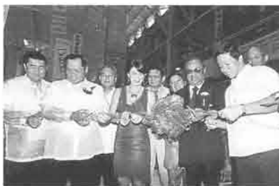
Government leaders helped open the show