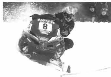
Snowmobile racing. It is important for our snowmobile sales that we are represented at the championships

For YMS, snowmobiles also provide a tremendous business opportunity that gives us and our dealers a year-round business season. Yamaha models like the VT500XL are extremely popular among private owners and rental operators alike because of their reliability, comfort and fuel economy. Farmers also use bigger models like the Viking III for winter work like hauling timber.