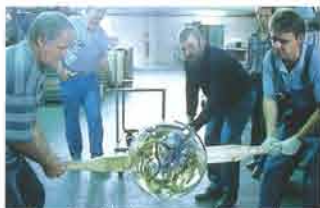
Modern Swedish glassware is famous along with the country's furniture and kitchenware for its simple sophistication of design