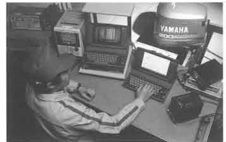
On the job developing outboard motors