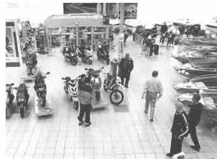
Yamaha Center Gothenburg. Customers find both boats and Yamaha products at a Yamaha Centre

To increase the value customers get from buying Yamaha, everyone who purchases a 2003-model motorcycle will be given the opportunity to take part in a one-day driving course that is held in several locations