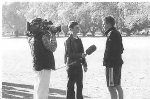
TVNZ interviews the Team New Zealand skipper for local fans

After the competitive but thoroughly enjoyable match, the teams had breakfast together at the Team New Zealand base. While refueling their bodies with food to recover from all the spent energy, the players enjoyed conversation about the match and many other topics. For the Yamaha team players, some of whom are from New Zealand, it was a wonderful chance to test their skills as well as spend some time with the Team New Zealand members, who are possibly as popular in New Zealand as the famed All Blacks national rugby team.