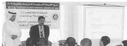
At the rescue craft seminar