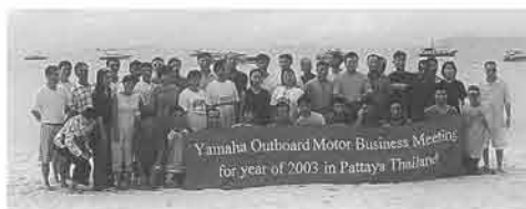
This year's trip to Thailand included a dealer meeting

T his autumn, Yamaha Motor (Shanghai) Trading Co., Ltd. (YMST) treated its most outstanding outboard motor and WaveRunner dealers to overseas tours of the U.S. and Thailand. In the case of both WaveRunner dealers and outboard dealers, the outstanding dealerships eligible for the trips