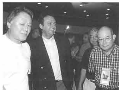
A total of 550 people gathered, including Marine and Motorcycle dealers from 240 shops