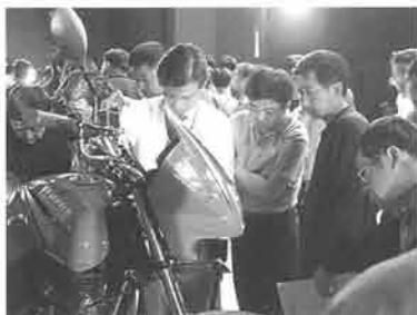
Chinese dealers are anxious to get the newly unveiled YBR125 in their showrooms