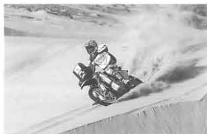
Carving up the Moroccan dunes