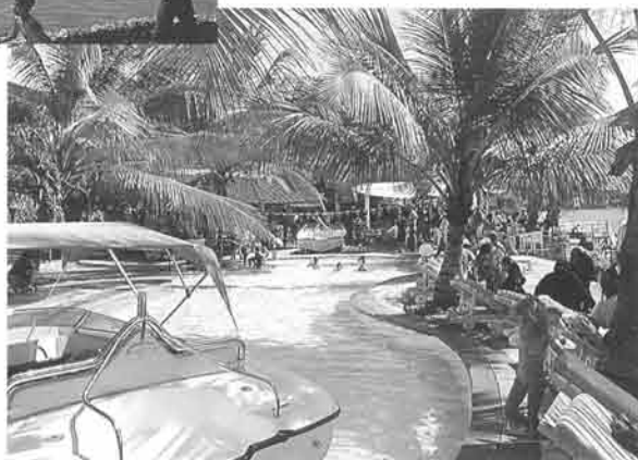
A special boat in the swimming pool also drew lots of attention

In addition to the displays and demonstrations of Yamaha outboards, visitors could enjoy boat rides on the beautiful bay.