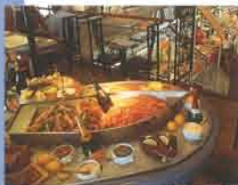
A restaurant specializing in the famous Swedish smorgasbord

Enjoying the great outdoors like the people of Sweden do is a good way to work up an appetite, and there are unique Swedish dishes for each season. A Swedish treat that you find being sold not long after the New Year is the semla , a wonderful companion for coffee that is made by hollowing out a bun and filling it with almond paste topped with fresh whipped cream and covered with a lid of bread. A typical menu for an outdoor feast during Sweden's big summer holiday, Midsommar , will be various types of pickled herring, potatoes flavored with dill and fresh-picked strawberries. As the short Swedish summer draws to a close in August, friends may gather around a pot of boiled crayfish with a strong cup of cheer. Of course, the Swedish word smorgasbord is known around the world for a buffet dinner with many dishes to choose from. In Sweden, the grandest smorgasbord of all is usually the one prepared in the home when families gather at Christmas time.