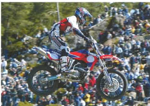
Everts will take part in the Motocross GP Class World Championships