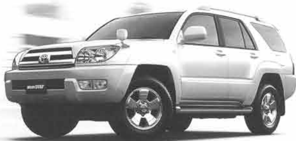
The New Hilux Surf SSR-G equipped with Yamaha's X-REAS suspension

Yamaha has begun supplying the X-REAS relative shock absorber system, which optimizes control of the relative movement of the right and left wheel suspensions, for the new model Toyota Motor Hilux Surf (known as the 4Runner in overseas markets). This new design is an improvement of the REAS model which Yamaha has provided Toyota in the past and provides additional shock-absorbing capacity by means of an interim unit. These new technological advancements provided by Yamaha have brought greatly improved drivability and driving enjoyment to Toyota sport utility vehicles (SUVs), which go far beyond the usual boundaries of these models. This creative use of Yamaha technology in Toyota products is serving to keep both companies at the top level of performance in the industry and first in the minds of customers.