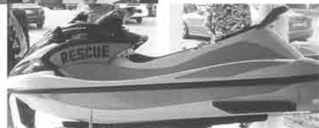
The special-coloring rescue spec XLT1200 prepared by KMC