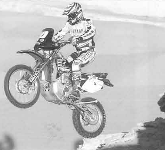
Catching the desert air