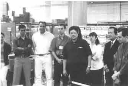
The kickoff ceremony, held in a YMDB warehouse

At Yamaha Motor Do Brasil Ltda. (YMDB) a revised parts system (PRO-PAC) is up and running, and a kickoff ceremony was held to celebrate this advance on October 1 in a YMDB warehouse. This new parts system is designed