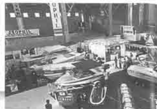
The ALS MARINE booth

This year the displays included a total of 21 Yamaha production models, starting with the company's very first motorcycle, the YA-1, and the YDS-1, which is generally considered the first Japanese sport motorcycle. In addition, there were three factory racers, three production racers and two Yamaha-built automobiles. Some 200 Yamaha fans showed up to see the beautifully preserved vintage bikes and enjoy watching them run in the production bike parade and test runs of the two automobiles. The excitement of the crowd reached its peak, however, when the two-stroke racers screamed around the track with their now nostalgic trail of white smoke.