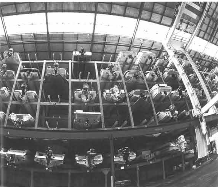
Auckland is a mecca of marine sports

Speaking to these Yamaha engineers we sense the spirit of true craftsmanship, an unending search for perfection and a pride that never settles for anything less.