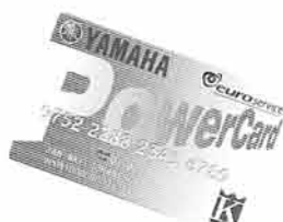
Our unique PowerCard with Euroservice

Yamaha Centres located in places that will not upset the established dealer network but rather serve to supplement it. These Yamaha Centres handle all Yamaha motor products exclusively as well as our boats. These Centres not only create good publicity for the brand but also offer a comprehensive answer to the increasing demands from our customers. Important ingredients include sample accessories, service and help with purchase financing.