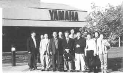
In the USA, Chinese dealers visited the YMUS marketing office in Kennesaw, Georgia

T his autumn, Yamaha Motor (Shanghai) Trading Co., Ltd. (YMST) treated its most outstanding outboard motor and WaveRunner dealers to overseas tours of the U.S. and Thailand. In the case of both WaveRunner dealers and outboard dealers, the outstanding dealerships eligible for the trips