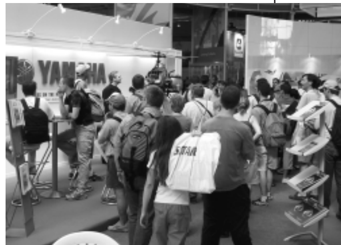
The steady flow of visitors to the Yamaha booth enjoyed displays like a simulation station for remote flight control of the helicopter