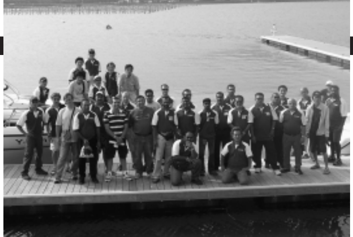
The service representatives attended this technical seminar from 14 countries