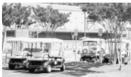
Shopping by golf car