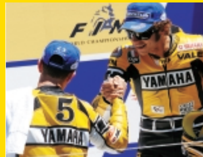
The Yellow & Black YZR-M1 caused a sensation at the US GP