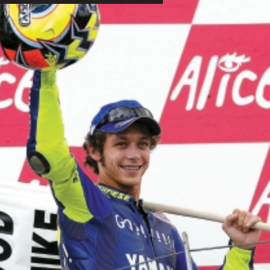
At round 10, the German GP, Rossi scored his 76th GP win, tying the 3rd highest total in GP history