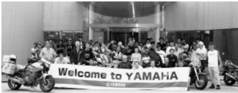
The Dutch touring group were greeted and congratulated at YMC's Communication Plaza after completing their 15,000-km trip