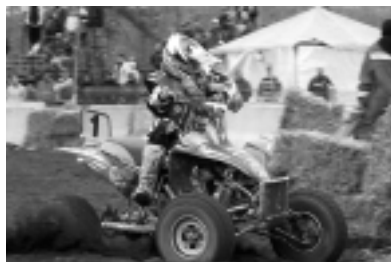
Action was hot on a tough motocross-based course