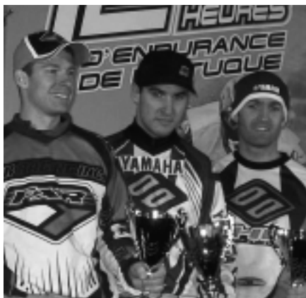
The captains of the three top finishing teams