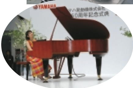
With encouragement from many honored guests, Yamaha Motor is already moving on to its next stage