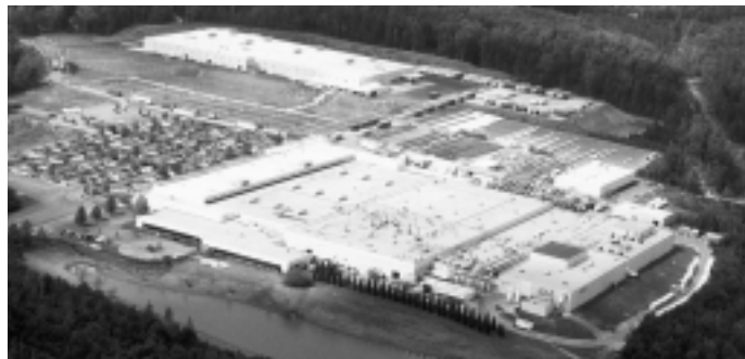
YMMC - YGC