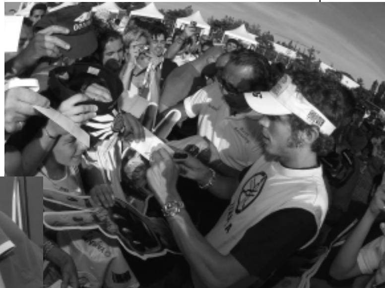
Rossi signs autographs for the gathered customers