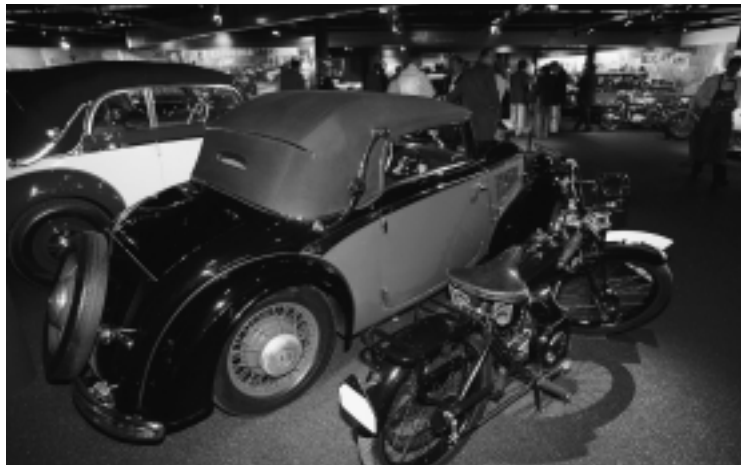
A fantastic museum of the vintage vehicles D'Ieteren Sport has handled