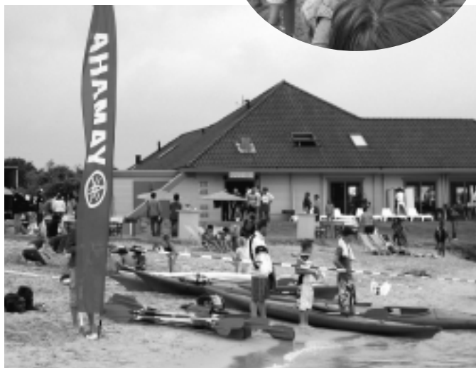
The celebration continued the next day at a beach in southern Holland