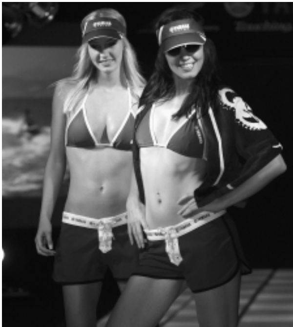
The new product introductions were made in a fashion-show type presentation.