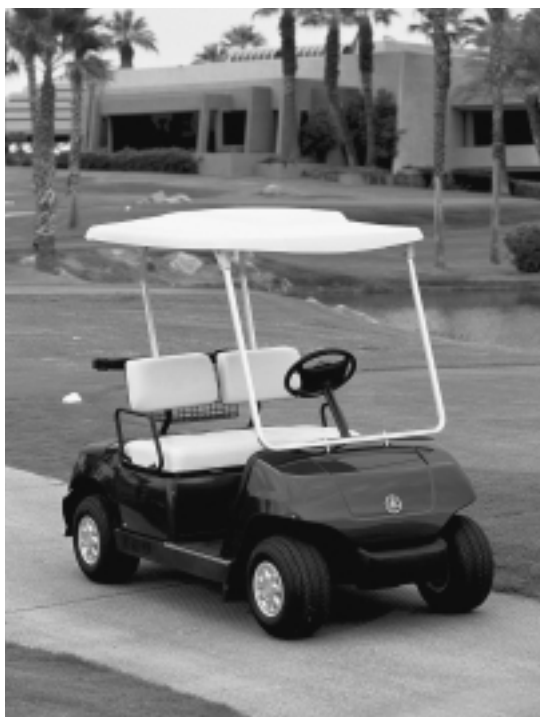
The golf car "G-MAX"

There are gasoline and electric golf cars in the market and the breakdown is about 35% gasoline and 65% electric. The electric golf cars are favored in the warm and flat areas of the southern US, but the golf cars of choice in the north, where it is colder and often hilly, are the gasoline golf cars.