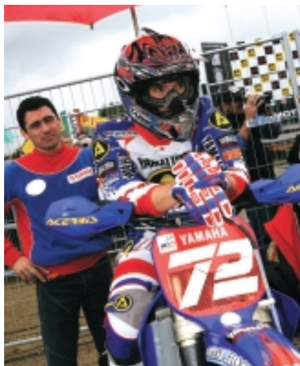
Coming back from his "slump," Everts won heat two of round 12

The 2005 Motocross World Championship is entering its final stages and the race for the season title is heating up in the premier MX1 class. As of the end of round 12, the Belgian GP (July 31), defending champion Stefan Everts and his YZ450FM stand at the top of the season ranking. But the battle for the title is far from decided, and Everts faces tough competition from rivals like Joshua Coppins (Honda) and Ben Townley (KTM). What's more, Everts has had a series of falls and disappointing finishes in the middle part of the season, that he himself has called a "slump." These included 4th place finishes in the first two meets of the second half of the season, rounds 9 and 10. But in rounds 11 and 12, the champ managed to keep his rivals from gaining ground by finishing 2nd and 3rd.