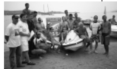
BURLA supplied WaveRunners for the first S-1 slalom race competition

The Turkish Jet-Ski Federation organized the First S1 Championship in the Bodrum region with the sponsorship of the Yamaha marine distributor BURLA Machinery Trade & Investment Company with support from its local dealers. The event was held on May 19th, which is Youth and Sports Day. Thanks to BURLA's close relations with the Federation, four units of Yamaha XL700 WaveRunners were used in the 1st leg of the Bodrum races. BURLA