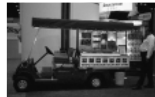
A modified "Beverage Car"

There are three major golf industry shows in the