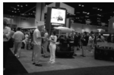
At the PGA Show