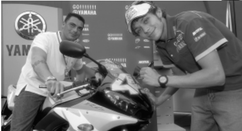
Rossi and the winner of a special Rossi-version R6 in a dealership sales campaign