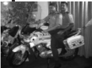
Maldives police officers with their new YMI-built police bikes

On July 10, a ceremony was held in Male, the capital of the Republic of Maldives, the island nation lying southwest of the Indian subcontinent, for the police to take delivery of an order of new police bikes built and outfitted by Yamaha Motor India Private Ltd. (YMI). These police bikes are specially equipped versions of the popular YMI-made 125cc 4-stroke model "Fazer."