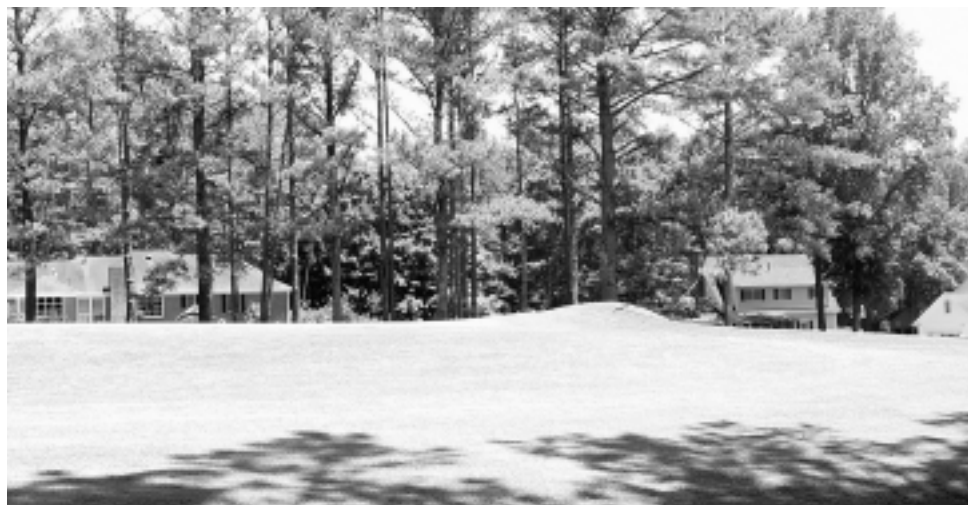
Many residential areas have their own golf course

Other than these two major golf cart markets, there are some emerging markets for 4 to 6 seater Passenger Cars that have found use in the resort areas and airports. There are also Utility Carts that have gained popularity among industrial customers. In dealing with all these customers, the entire YGC staff makes every effort to provide our customers with satisfaction and KANDO .