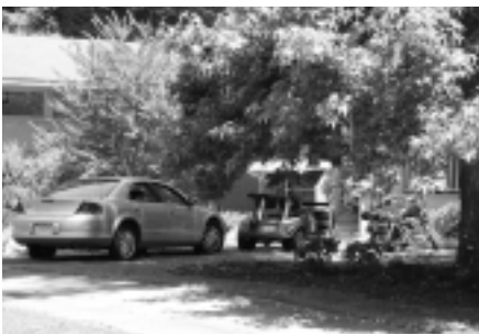
Everybody has a golf car